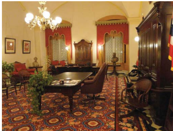
Governor's Formal Office, Statehouse