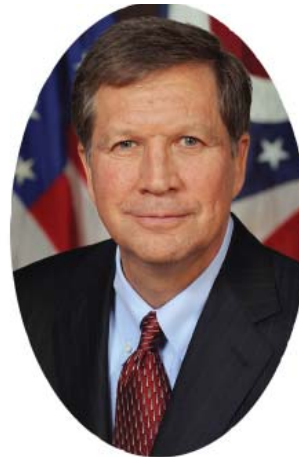
John R. Kasich ** 69th Governor 2011-