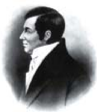
Edward Tiffin * First Governor 1803-1807