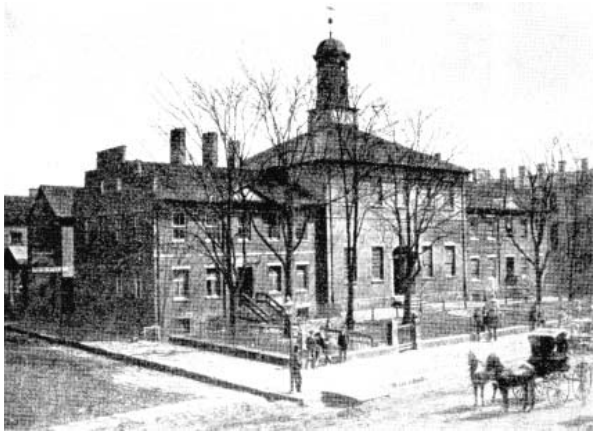
Second State Capitol Zanesville